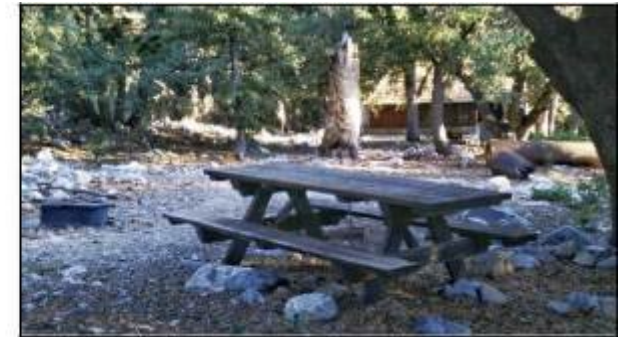
Crystal Lake Campground, Elev. 5,500'

This one-of-a-kind place is perfect for outdoorsy artists who crave a rustic camping experience. Four people maximum (artist + family/guests). Amenities include: