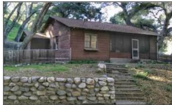
Volunteer House, Hwy 39, Elev. 2,000'

This historic 2-bedroom house, once a Fire Captain's residence, is now the headquarters for the Monument's volunteer program. It's a rustic experience, complete with an outhouse (although hot showers and flush toilets are next door). Two to four people max (i.e. artist + family/guests). Features: